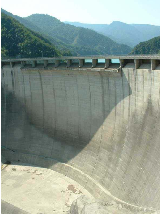
Dam basin, dam, lake and hills