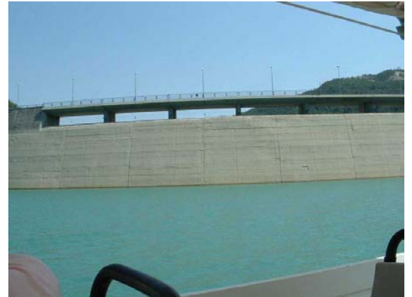
Dam showing curvature from boat