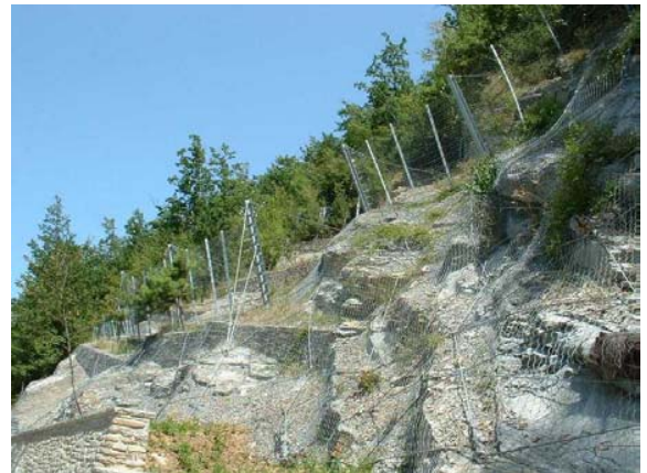
'Geological safety' barriers to catch falling debris