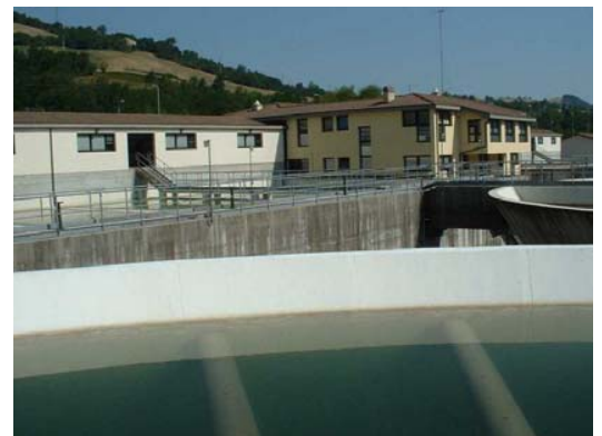
Settlement & treatment tanks & control centre